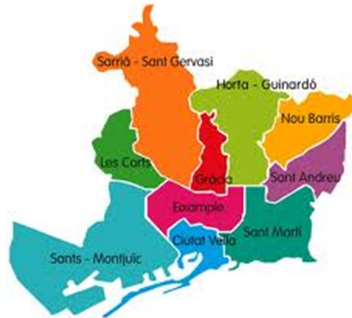
The 10 districts of Barcelona

Structure and staff: a district support officer in each of the city's districts (10), two central support officers and one service coordinator.